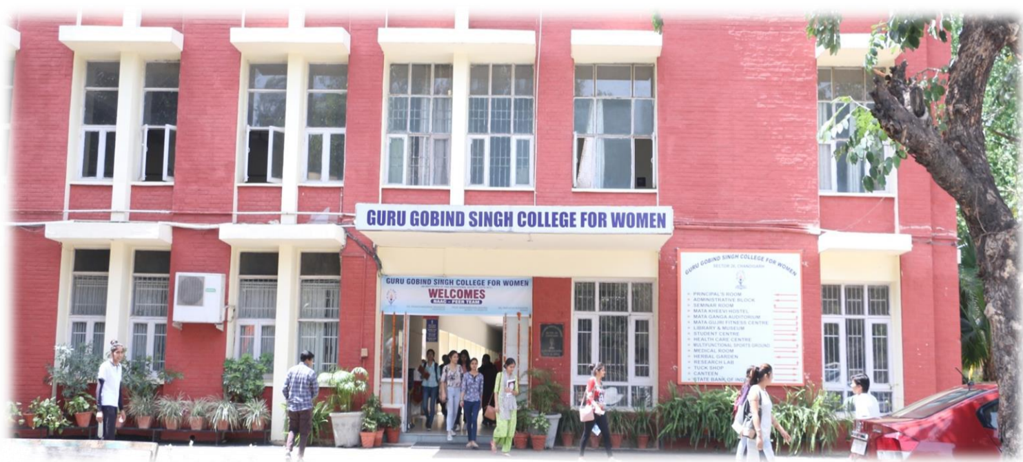
Best Maintained Campus in Chandigarh since 2008